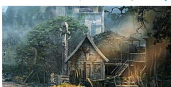
This game kills boredom once and for all! Vikings: Free Online Game