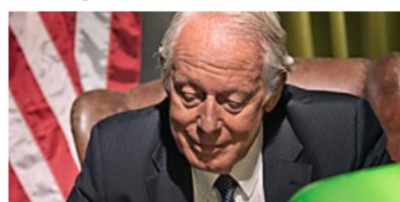
Capitol Hill Gives Homeowners Who Owe Less Than $300-625k A Once-In-A-Lifetime Mortgage Bailout LowerMyBills