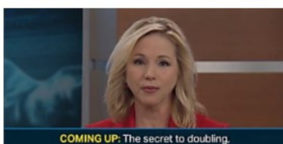
Subjects Wanted for "7-Figure Learning" Money Morning