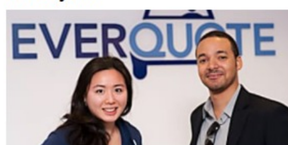
Tucson, Arizona: This Brilliant Company Is Disrupting a $200 Billion Industry EverQuote Insurance Quotes