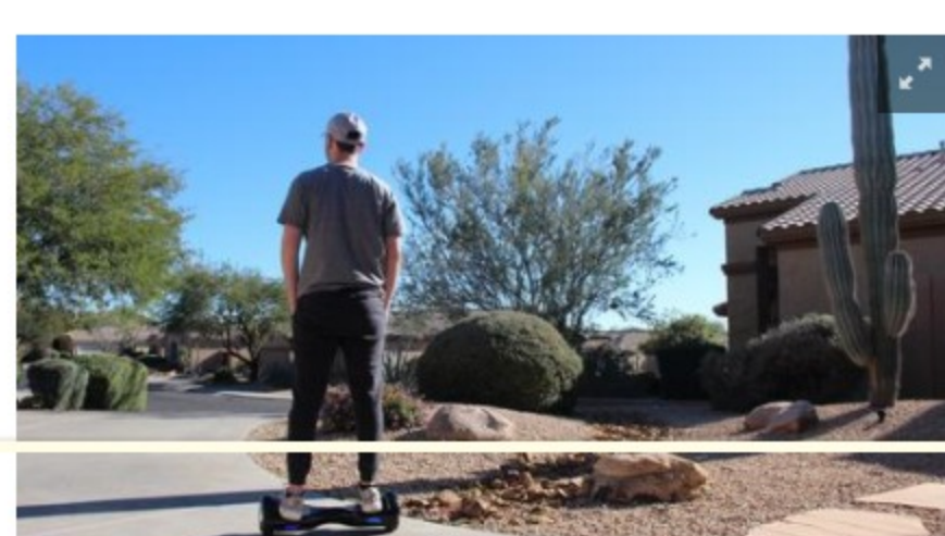
Hoverboard electric scooters are at the top of many kids' Christmas list this year, but... more