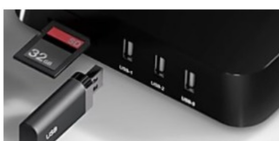
Cable Companies Furious over This New Device Smart TV