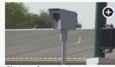
Photo enforcement cameras are big money-makers for cities but also keeps roads safe.